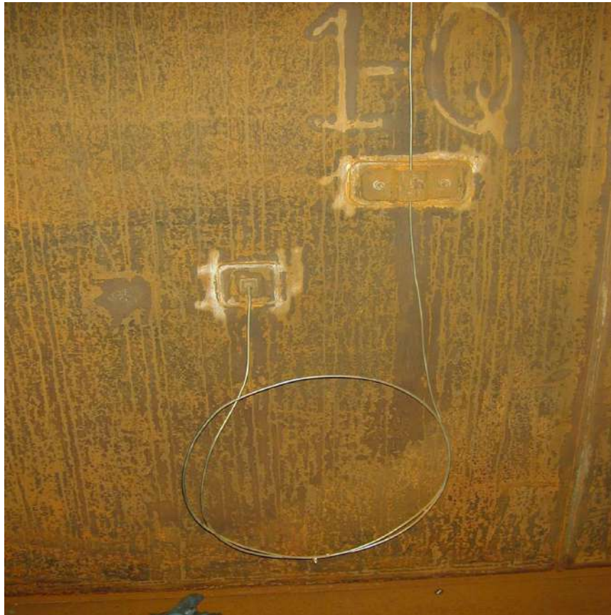
Weld pad sensors in LNG storage tank